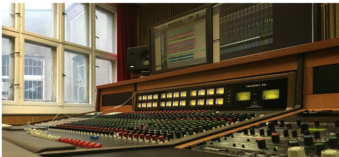
dBS music production school

During Loop Ableton is teaming up with Berlin-based CTM - Festival for Adventurous Music and Art to present an evening of performances across three stages at The Volksbuehne theater, as well as a club night at Prince Charles in collaboration with CDR Projects – Loop tickets include entry to all of the nighttime events. Other Loop programming partners include dBS music production school , The Wire magazine , Berlin Community Radio and FACT .